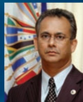
Assistant Secretary General Albert Ramdin