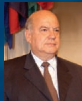
Secretary General José Miguel Insulza

Antigua & Barbuda Guyana Argentina Haiti The Bahamas Honduras Barbados Jamaica Belize Mexico Bolivia Nicaragua Brazil Panama Canada Paraguay Chile Peru Colombia Saint Kitts & Nevis Costa Rica Saint Lucia Cuba* Saint Vincent & the Grenadines Dominica Suriname Dominican Republic Trinidad & Tobago Ecuador United States of America El Salvador Uruguay Grenada Venezuela Guatemala